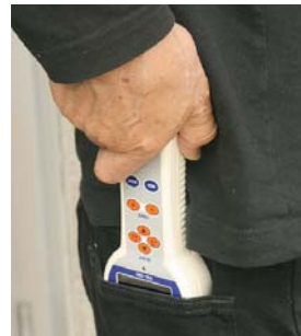
Small enough to fit a pocket